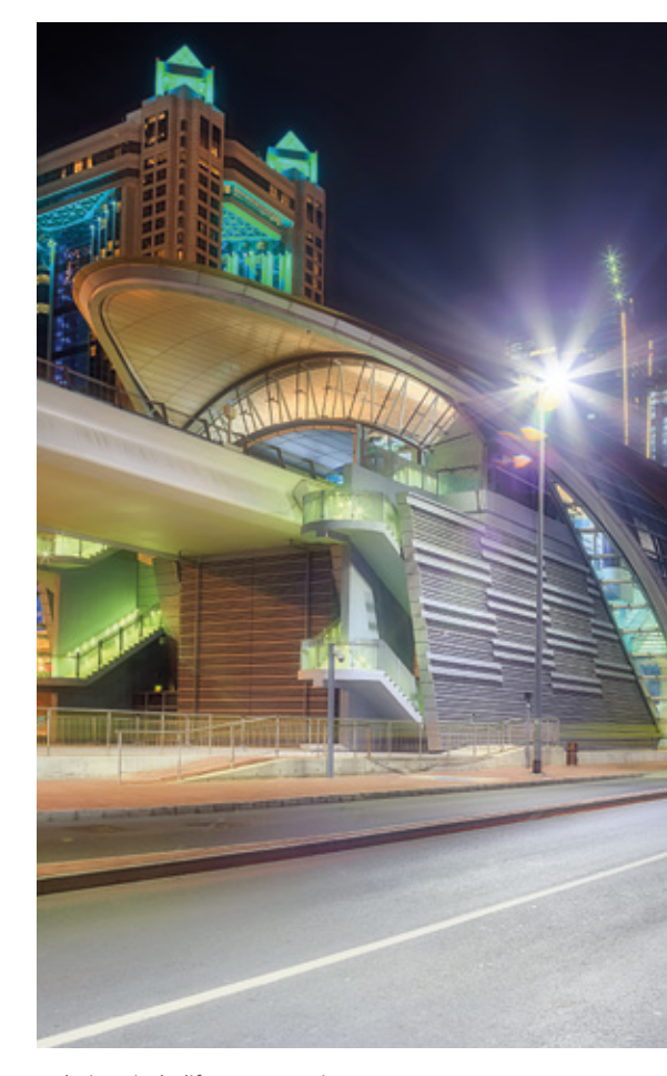
Dubai Burj Khalifa metro station – protected by SteelMaster

The Jotun Group is one of the world's leading manufacturers of paints, coatings and powder coatings. Jotun's operations ensure the very best in paint systems and products to protect and decorate surfaces in the residential, shipping and industrial markets. Everything we do, from development to production, marketing, sales and consultancy for various paint systems and products to protect the property of our customers the world over.