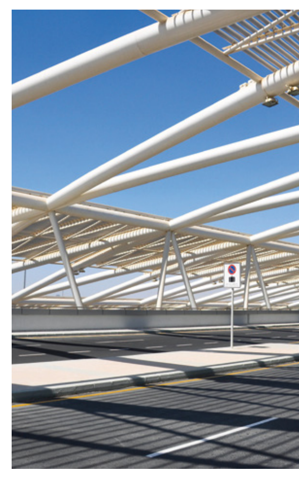
Cairo International Airport, Terminal 3 – protected by SteelMaster