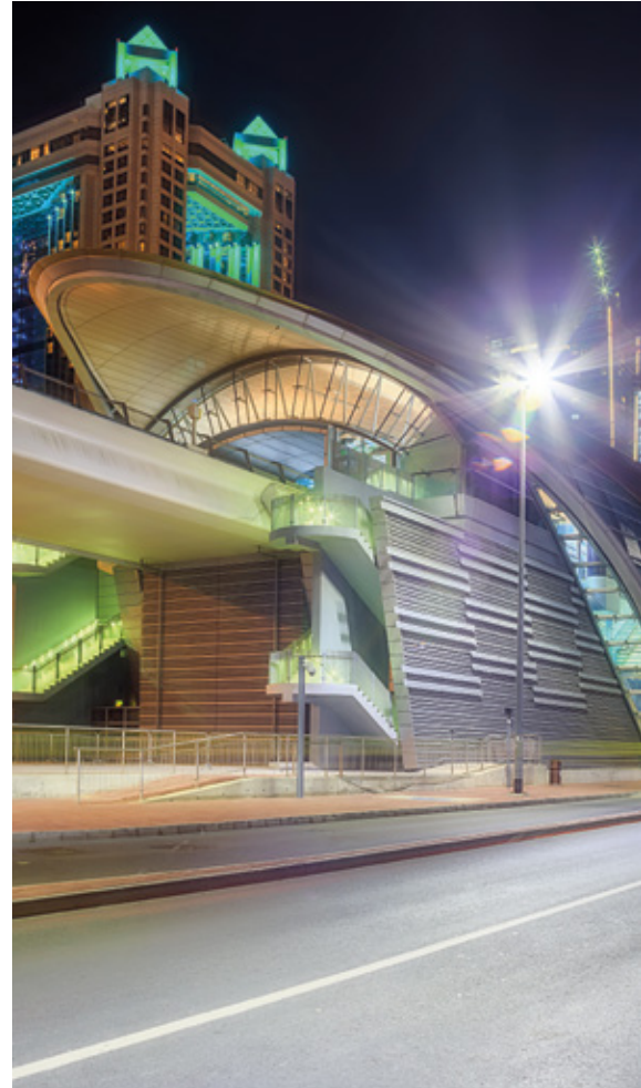
Dubai Burj Khalifa metro station – protected by SteelMaster

SteelMaster intumescent paint can be applied to offer excellent levels of fire protection.